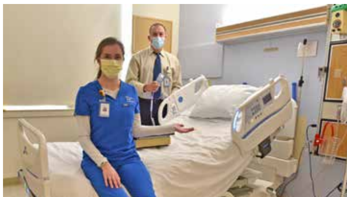
Westerly Hospital installed new beds equipped with technology that indicates the status of the patient by color coded lights on the floor.

Previously, a limited number of telehealth carts were available when a provider needed to meet virtually with a patient. However, having built-in technology at the fingertips of caregivers in each room enhances communication in ways that go far beyond immediate concerns involving the pandemic and visitor restrictions. The technology can also potentially allow out-of-town family members to be 'at the bedside' of a loved one during end-of-life discussions or bring into a room off-site L+M medical staff to advise during an emergency. A provider has the capability to invite a sub-specialist from Yale New Haven Hospital to join a telehealth visit to provide guidance on a patient with complex medical issues.