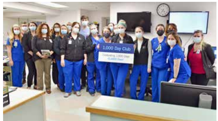
The Cardiac team at L+M Hospital celebrated achieving 1,000 days without a Central Line Associated Blood Stream Infection.

High reliability efforts were noted in 2022 with Westerly Hospital earning an “A” Hospital Safety Grade from The Leapfrog Group. This national distinction celebrates Westerly Hospital’s achievements in protecting hospital patients from preventable harm and errors. L+M is nipping at the heels of this distinction with a “B” grade.