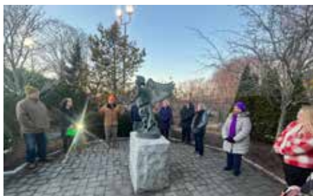
The Auxiliary held its 38th annual “Lights of Love” campaign which invites the community to remember or honor a loved one and to support Westerly Hospital and the caregivers that touch the lives of thousands of patients to provide hope, healing and recovery.