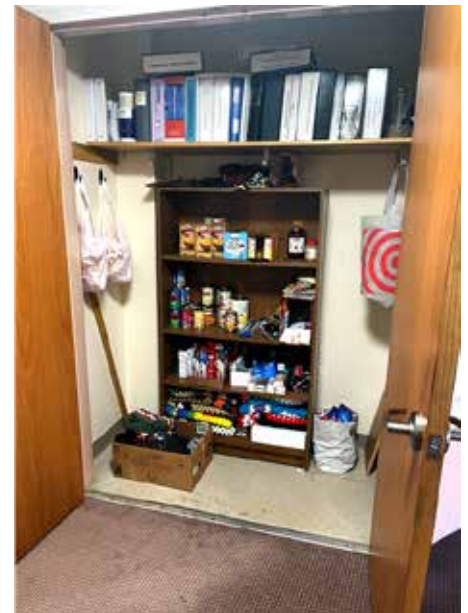
The Behavioral Health team address social determinants of health by offering patients access to a "Needs Pantry" which stocks basic food, hygiene and clothing products.