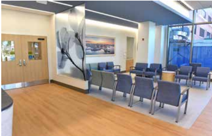
The new waiting area at L+M Emergency Department opened in 2022.

In the L+M ED, the Pediatric Emergency Program celebrated its 10th anniversary. In 2012, L+M created a special treatment area within the ED to care for children with emergency medicine pediatricians available seven days a week from 3 to 11 pm. This is the region's only dedicated Pediatric Emergency Program and features generally shorter wait times and a family-friendly environment, both of which help to reduce family stress in a time of crisis.