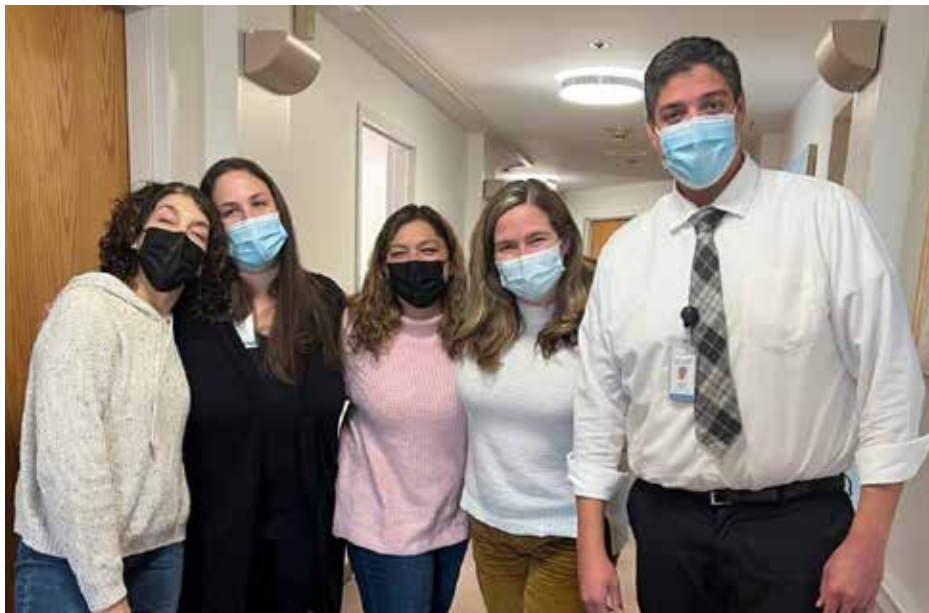
The Intensive Outpatient Services team are part of a group-based program that provides intensive therapeutic services as a preventative measure or step-down from psychiatric hospitalization.

At Westerly Hospital, an 18-bed unit is dedicated to care for geriatric patients in need of psychiatric care. The program primarily treats patients aged 55 and older requiring an intensive and safe setting. The assessment and treatment program include crisis intervention, family consultation and rehabilitative intervention.