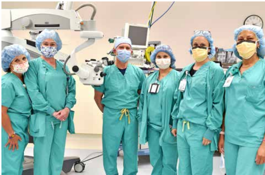
The Surgery team at Pequot Health Center performed the first-in-Connecticut iris prosthesis implant surgery.

Over time, some weight-loss surgery procedures may need to be revised. L+M performs revisional surgeries which range from correction of issues leading to complications, to conversion from one weight-loss procedure to another which better suits the current medical conditions of the patient.