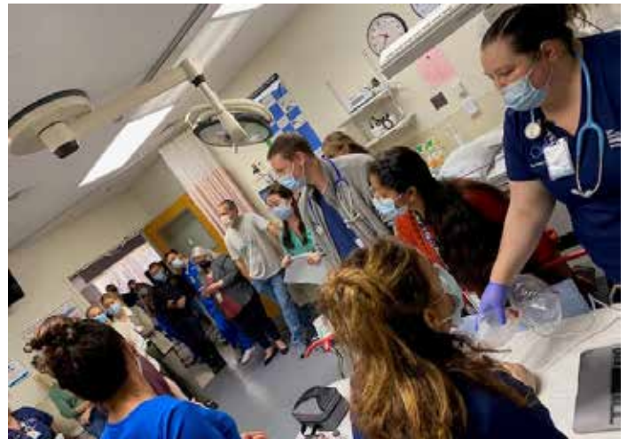
Westerly Hospital invested in new pediatric respiratory support devices such as bubble CPAP, a pediatric high flow oxygen delivery device.