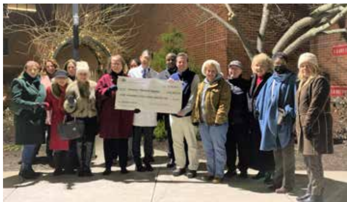
The Auxiliary of Lawrence + Memorial Hospital celebrated a gift to the hospital Emergency Department Renovation Project.