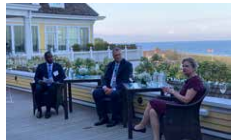
A reception at Ocean House in Watch Hill, RI, gave donors the opportunity to hear an informative and inspiring affirmation of the long-term commitment by Yale New Haven Health to Westerly Hospital and the patients it serves.