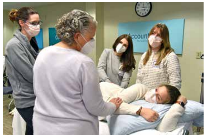
Labor and Delivery nurses at L+M participated in a Spinning Babies program which promotes natural positions that support delivery, prevent large lacerations and C-sections. The techniques can also decrease labor time and help ease pain for laboring mothers.