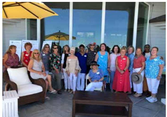
The Auxiliary of Lawrence + Memorial Hospital gathered for the first time since the pandemic in support of the hospital.

In addition, gifts and pledges totaling $1,281,845 million from more than 770 donors continue to support enhanced programming, equipment acquisition and staff education to support the hospital's mission. The annual golf outing at the Misquamicut Club generated a record $80,000.