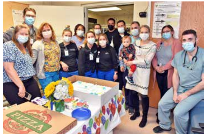
L+M ED staff celebrated the 10th anniversary of the opening of the pediatric emergency program.