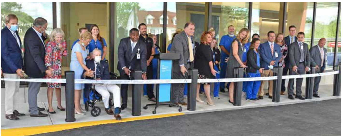
Hospital leaders and guests cut a branded ribbon to open the new waiting and triage areas at the L+M Emergency Department.

In addition to implementing specific screening tools for the elderly, the ED staff at Westerly Hospital received specialized training for children as part of the Improving Pediatric Acute Care Through Simulation (ImPACTS) Collaborative, a national effort to measure and improve the quality of care provided to critically ill and injured pediatric patients in emergency departments using simulation. To meet the needs of children in the ED, Westerly Hospital invested in new pediatric respiratory support devices such as bubble CPAP, a pediatric high flow oxygen delivery device. Additionally, Westerly Hospital coordinates with local EMS providers to ensure that children can be safely transported to Yale New Haven Children's Hospital if they need to be admitted for a higher level of care.