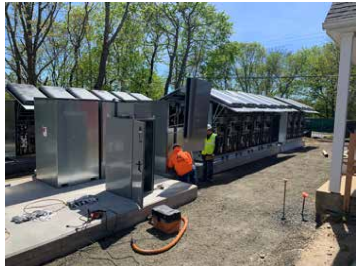
Fuel cells installed on the L+M campus support the hospital's critical power upgrade project and will provide redundancy in back-up power.

In addition to the environmental benefits, the fuel cell project also supports the larger critical power upgrade project underway as part of the hospital's Emergency Department renovation. Although back-up generators remain the first line of defense during a power outage, fuel cells provide continuous power to ensure critical infrastructure is always running. The power project will provide redundancy in back-up power as well as overall campus sustainability.