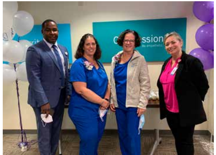
Nurse Residency Programs at L+M and Westerly hospitals were among the Yale New Haven Health programs to receive recognition for assisting nursing school graduates transition into their roles as professional, acute-care nurses.

Employees are also engaged in the Diversity, Equity, Inclusion and Belonging Council (DEI&B) which was established in 2018 to help employees work together to create and promote a culture of respect and inclusion. Among other activities, the group hosted a panel discussion on “Impactful Leadership: Centering Women’s Voices in celebration of Women’s History Month. The panel included diverse leaders who shares stories of their career journeys and offered insights for those who aspire to leadership positions.