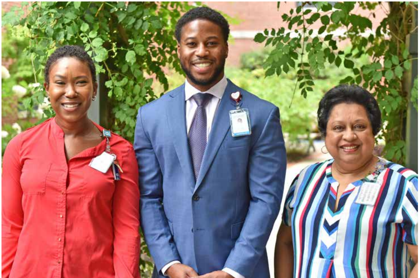
The Diversity, Equity, Inclusion and Belonging Council at L+M helps employees work together to create and promote a culture of respect and inclusion.