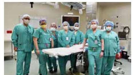
Operating Room staff at Westerly Hospital handled a growing number of surgical cases in 2022.