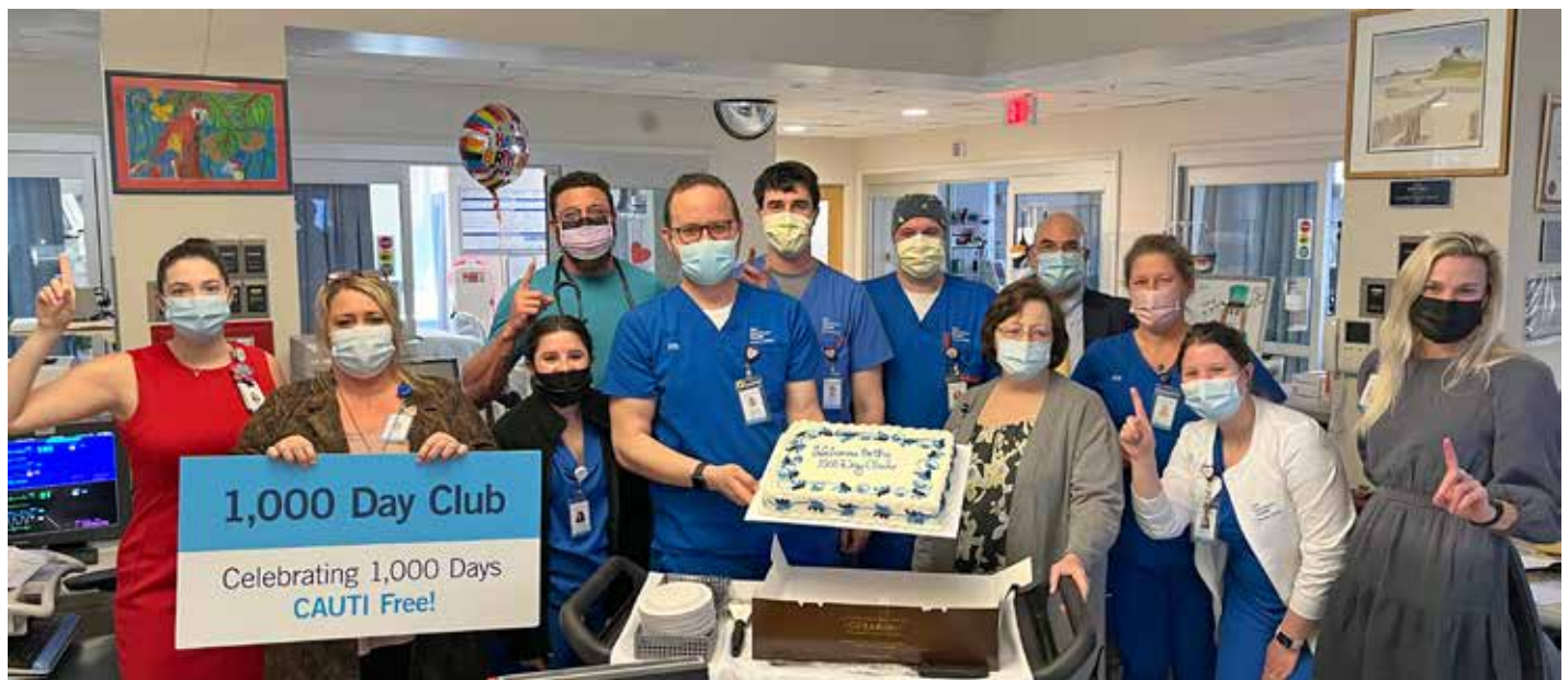
ICU staff at Westerly Hospital were recognized for achieving 1,000 days without a Catheter-Associated Urinary Tract Infection.