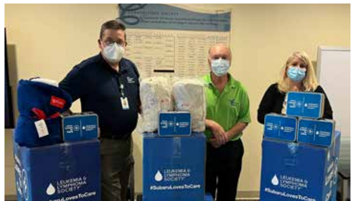
The Westerly Hospital Foundation received a gifts from Valenti Subaru, in partnership with the Leukemia & Lymphoma Society to benefit patients.