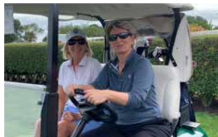
Golfers supported the Westerly Hospital Foundation with the most successful outing at the Misquamicut Club raising more than $80,000.