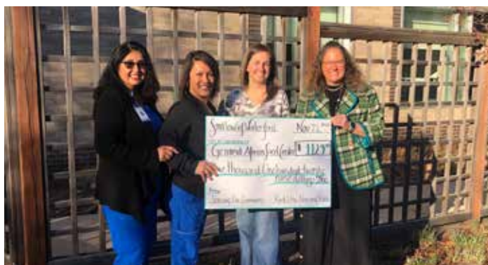
Smilow Cancer Center at Waterford staff showed their generosity with a donation to the Gemma E. Moran United Way/Labor Food Center in New London.