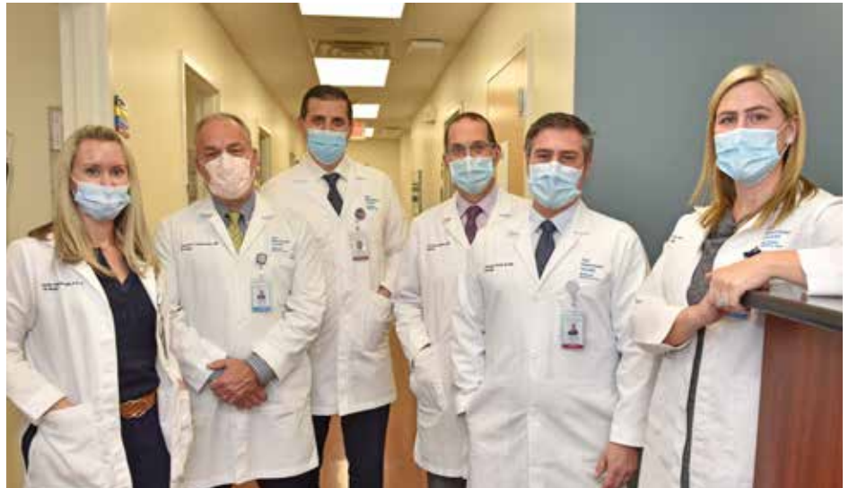
Patients in Warwick, RI, can now schedule an appointment with a Yale Medicine Urologist.

Specialists offer options in sexual medicine, male infertility, erectile dysfunction, hypogonadism, and Peyronie's disease. In the Warwick office, patients can benefit from urodynamic testing for nerve and muscle function, pressure around and in the bladder, and urine flow rate.