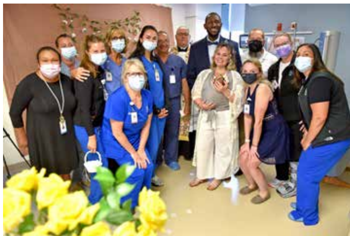
Neonatal Intensive Care Unit (NICU) staff members arranged a wedding ceremony for parents of baby who spent 105 days at L+M.

Parents with a baby in the NICU become part of the staff family and the L+M team have been recognized for capturing the essence of quality health care. Last summer, a young couple whose wedding plans were delayed when their daughter was delivered prematurely, were married in a special ceremony organized by the NICU team. The event garnered local, national and international media coverage and was made more special when the baby was discharged home one day after the ceremony.