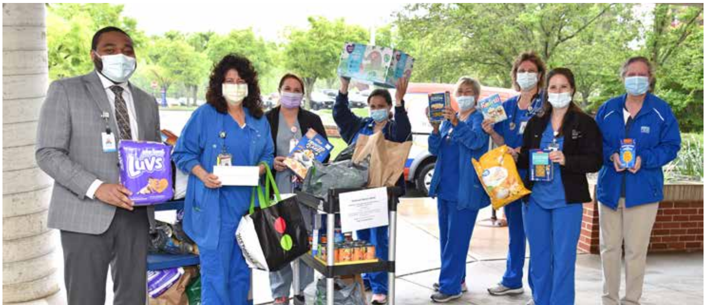
The Gemma E. Moran United Way/Labor Food Center in New London was the beneficiary of food and a donation which was a collaborative effort by L+M nurses, union representatives and others to support the community.

L+M created a Food Cupboard to support colleagues who may need to supplement their grocery list.