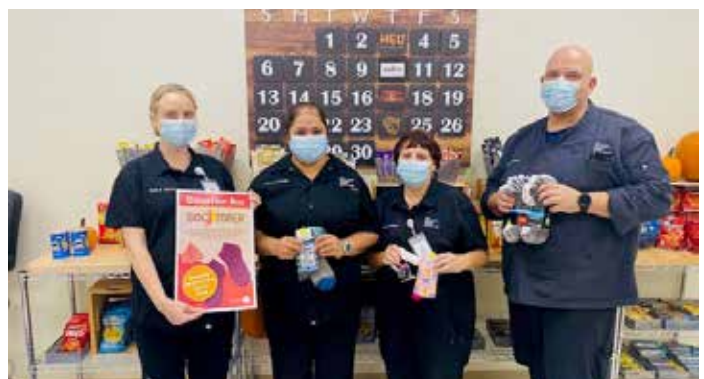
The food and nutrition department at Westerly hospital donated 84 pairs of new socks to the Jonnycake Center in Westerly.