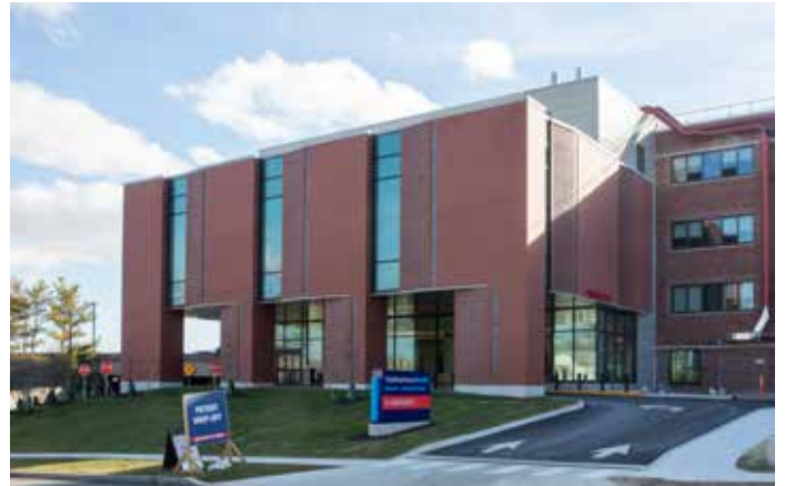
Completion of the exterior work on the L+M ED was completed and work moved inside.

Following its affiliation with Yale New Haven Health in 2017, L+M identified expansion of the Emergency Department as a unique opportunity and a System priority to address both immediate clinical, infrastructure and long-term planning needs at the hospital.