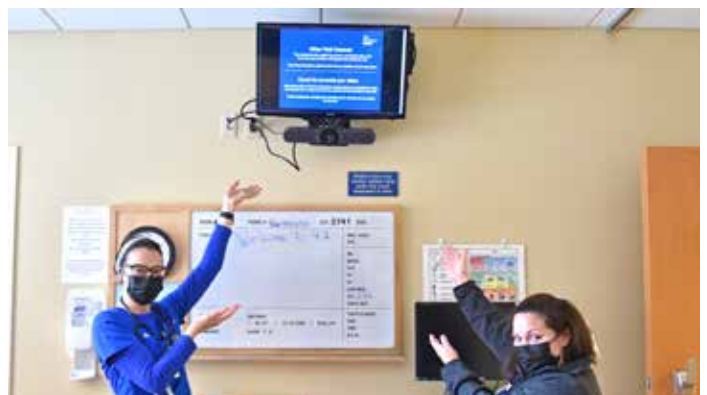
In 2022, telehealth capabilities were hard-wired into every patient room at L+M, making it easy and convenient to bring patients and providers together for care.