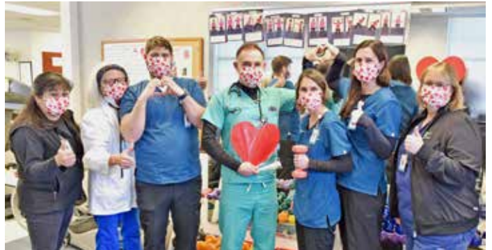
The Cardiac Rehab team at Westerly Hospital provide exercise, education, counseling and support for patients and their families following a cardiac event.

Cardiac patients at L+M also benefit from a dedicated Heart and Vascular management clinic where they meet with all their caregivers and receive treatment in one location. High-risk