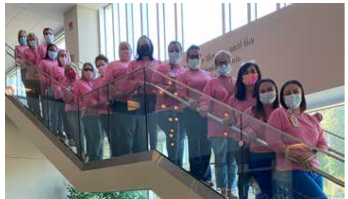
Staff provide the greatest of care to Oncology patients at Smilow Cancer Care Center in Waterford.

cancer deaths for both men and women. Each year, more people die of lung cancer than of colon, breast and prostate cancers combined.